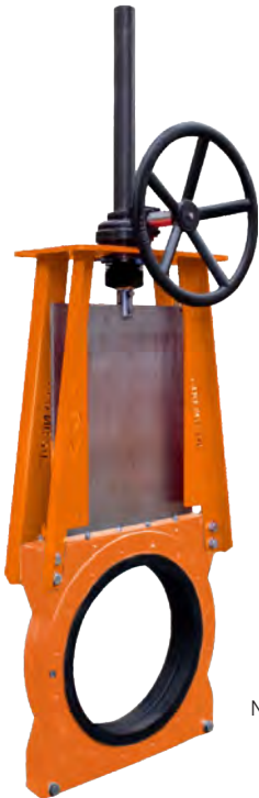
Only Premium Materials are used in valve construction.