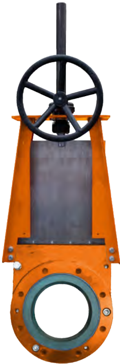
Zero discharge to atmosphere. Full round port design.