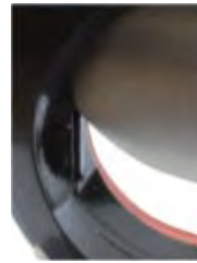
Epoxy Coated with Lip-Seal