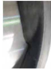
Soft Rubber Lined