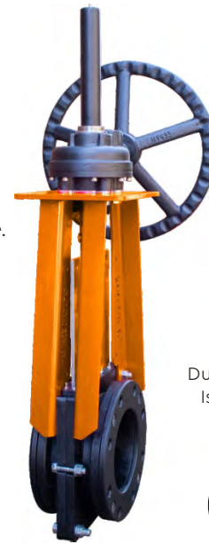
Dual Sleeve Isolation